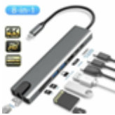
8-in-1 multiport adapter - $13.59 (previously $26.33)