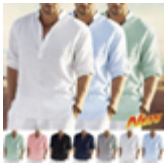
Men's Lightweight linen shirt - $5.89 (previously $11.81)