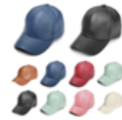
$4.39 (previously $9.81)