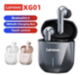
Lenovo bluetooth earphones - $21.64 (previously $39.32)