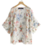
Sheer floral kimono - $5.87 (previously $12.46)