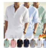
$5.89 (previously $11.81)