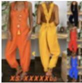
Women's wide-leg jumpsuit - $5.92 (previously $11.86)