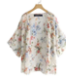
$5.87 (previously $12.46)