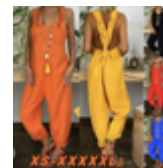
$5.92 (previously $11.86)