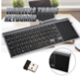
Wireless keyboard and trackpad - $13.33 (previously $25.59)