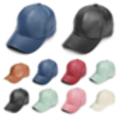
Unisex faux leather baseball cap - $4.39 (previously $9.81)